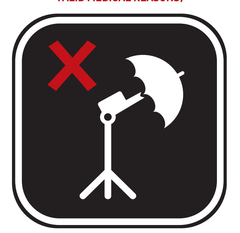
POLES, FLAGPOLES, STICKS, LARGE PHOTOGRAPHY EQUIPMENT (E.G. TRIPODS)