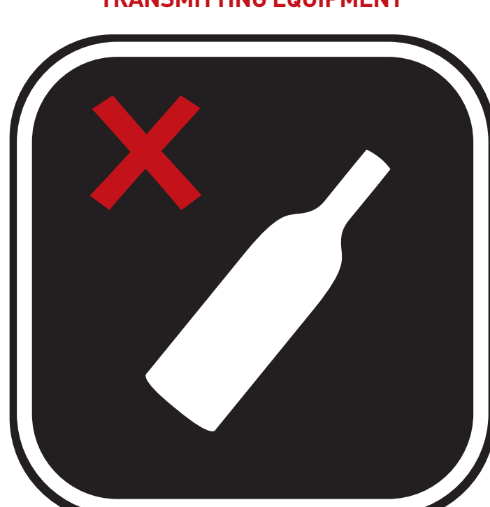
GLASS BOTTLES OR BLUNT OBJECTS