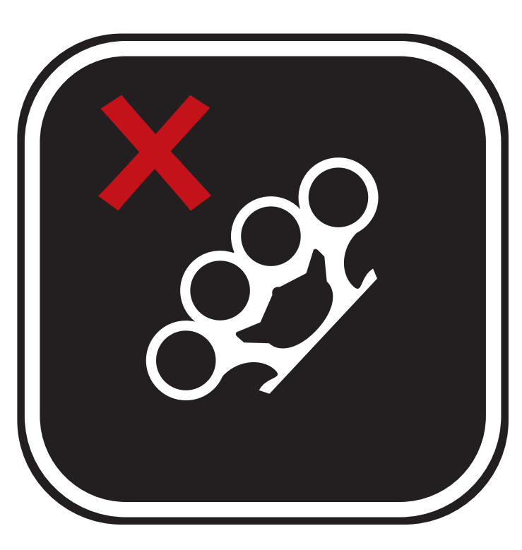
REPLICA OR BLUNT OFFENSIVE WEAPONS