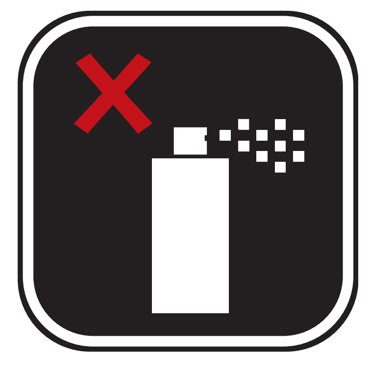
MACE OR PEPPER SPRAY. CHEMICALS, INCENDIARY DEVICES