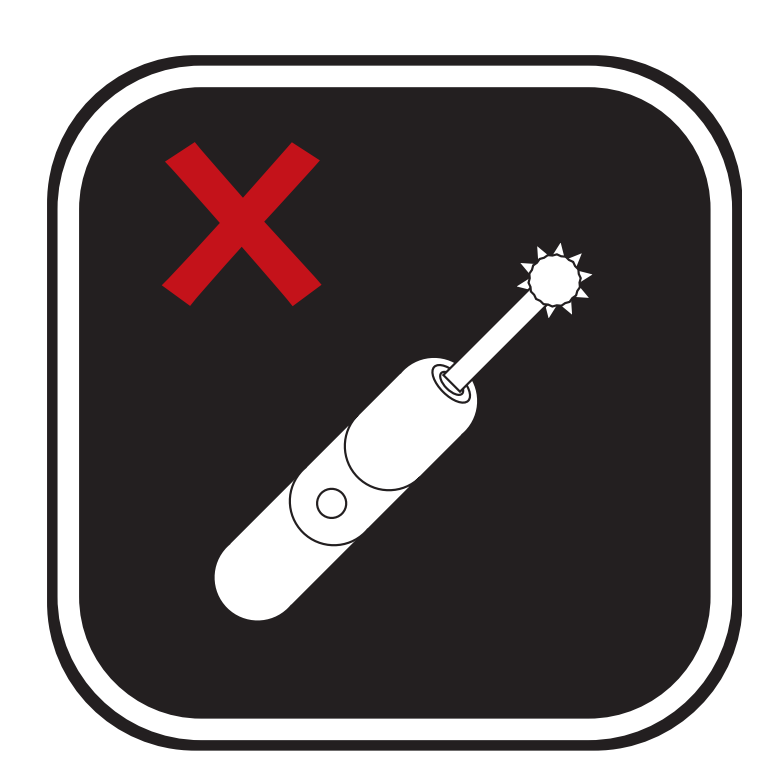
LASERS POINTERS, ELECTRONIC TRANSMITTING EQUIPMENT