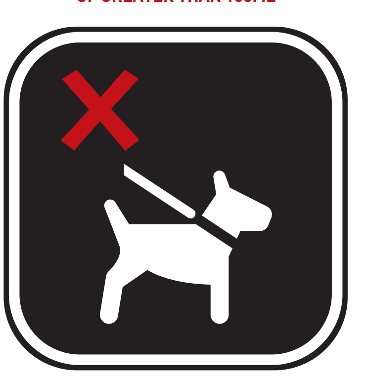
ANIMALS (SAVE FOR TRAINED ASSISTANCE OR GUIDE DOGS )