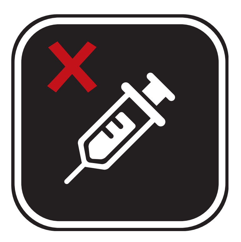
NEEDLES (SAVE AS REQUIRED FOR VALID MEDICAL REASONS)