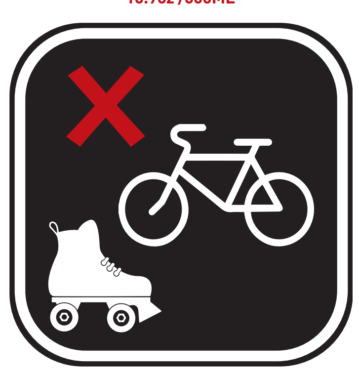
MOTORCYCLES, BICYCLES, ROLLER-SKATES