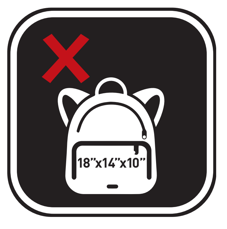
BAGS/BACKPACKS LARGER THAN 18"X14"X10" AND LARGE OBJECTS/LUGGAGE ITEMS (E.G. SUITCASES, COOLERS, ETC)