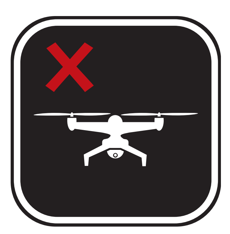
DRONES, UNMANNED AERIAL DEVICES