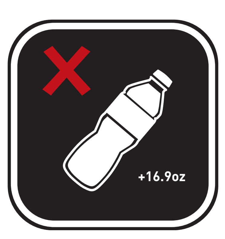
PLASTIC BOTTLES LARGER THAN 16.9oz /500ML