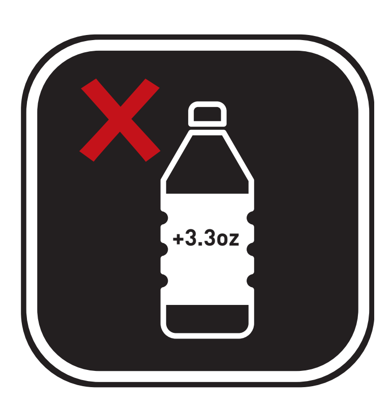
NON-CONSUMABLE LIQUIDS IN CONTAINERS OF GREATER THAN 100ML